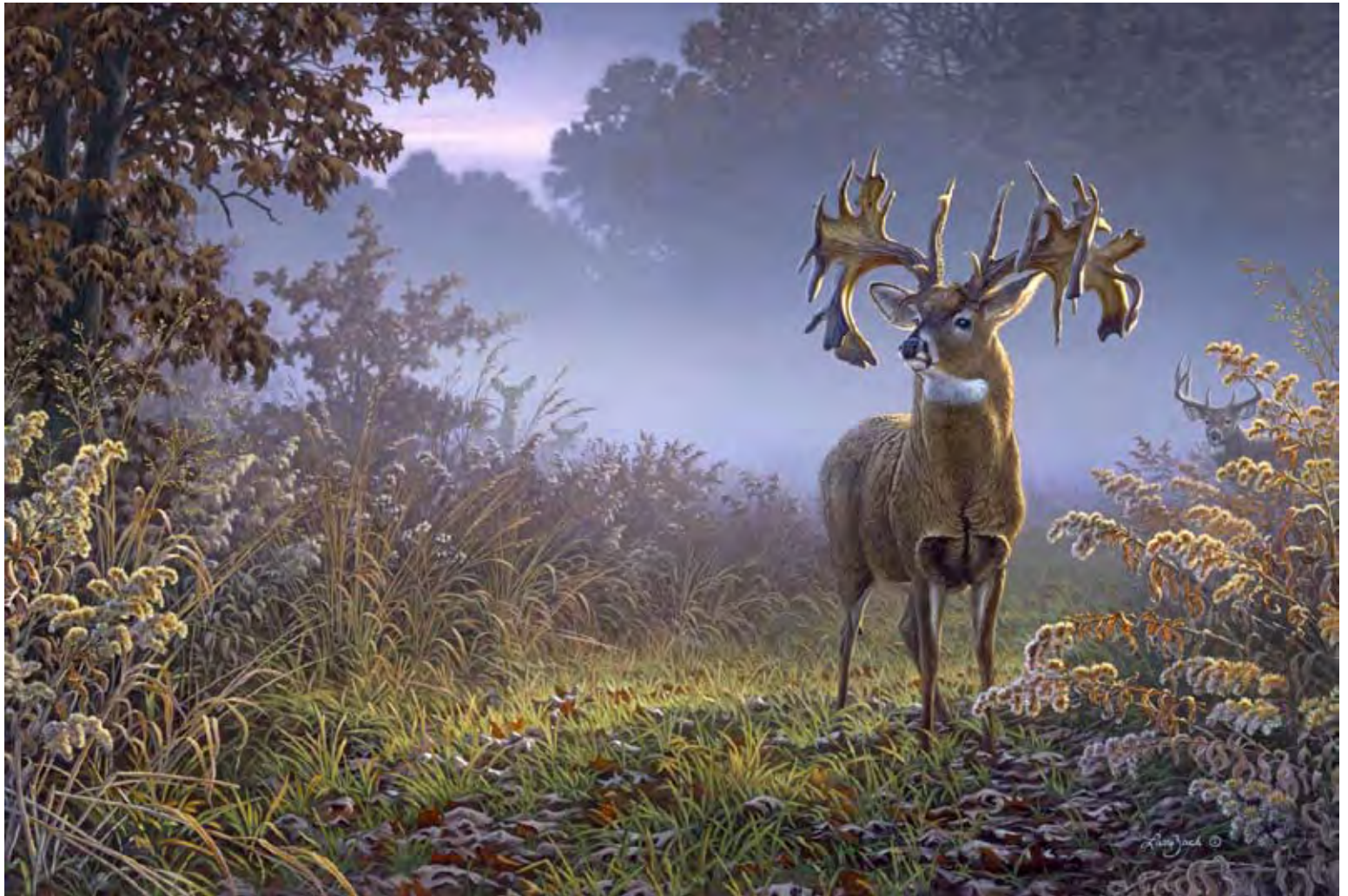
"Dream Bucks I"